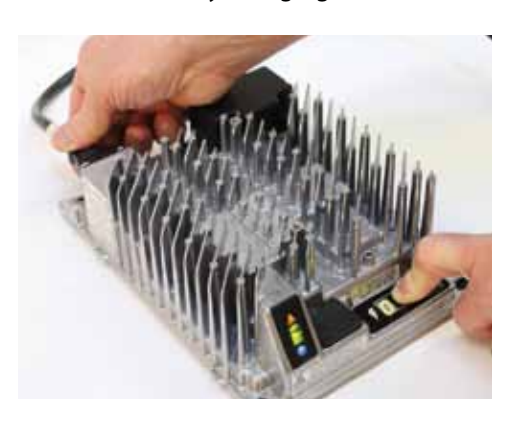
Figure 2: Reconnect AC input while holding the Select Charge Profile Button.

2. While reconnecting AC input, press and hold the Select Charge Profile Button. Hold the button until Error Indicator is on and Battery Charging Indicator starts flashing.